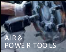
AIR & POWER TOOLS